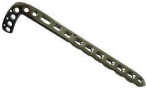
Proximal Tibia Locking Plate