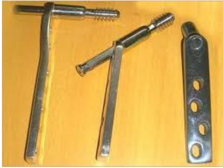
DCS with Leg Screw