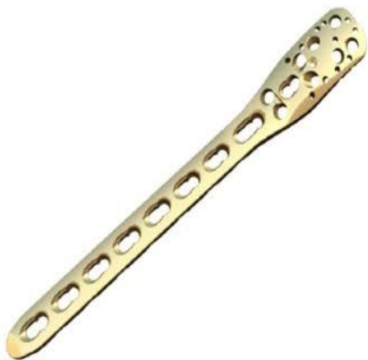
Proximal Humorous Locking Plate Titanium