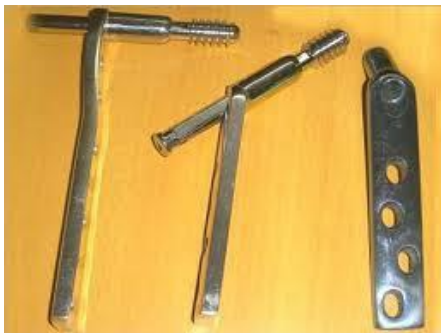
DHS with Leg Screw