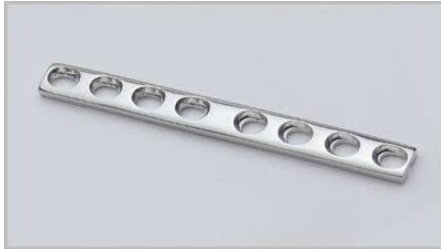
DCP Narrow Stainless-Steel Plate