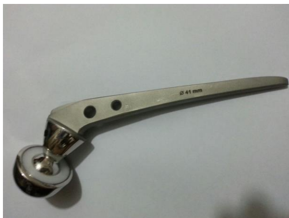
Bipolar Stainless-steel crafted