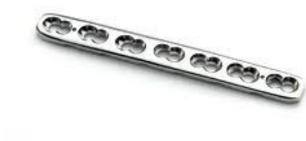
Locking Plate Titanium Small