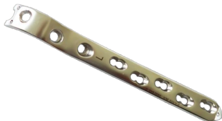
Proximal Femur Locking Plate