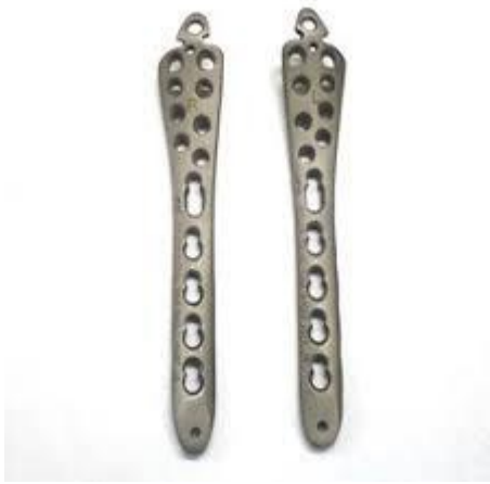
Distal Tibia Locking Plate