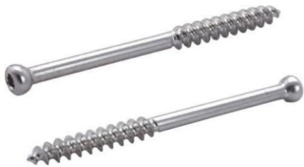
Cancellous Screw 6.5MM (16*32*full) Stainless Steel