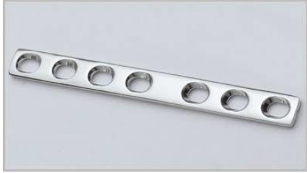
DCP Small Stainless-Steel Plate