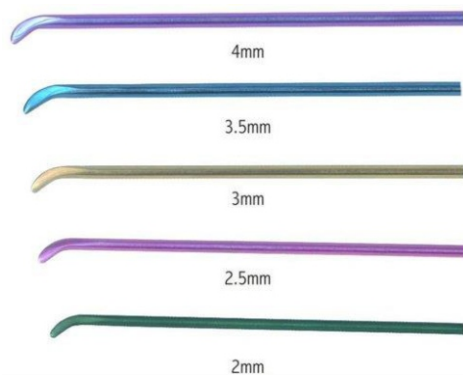
Elastics nails titanium