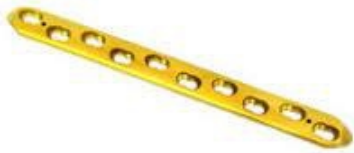
Locking Plate Titanium Broad