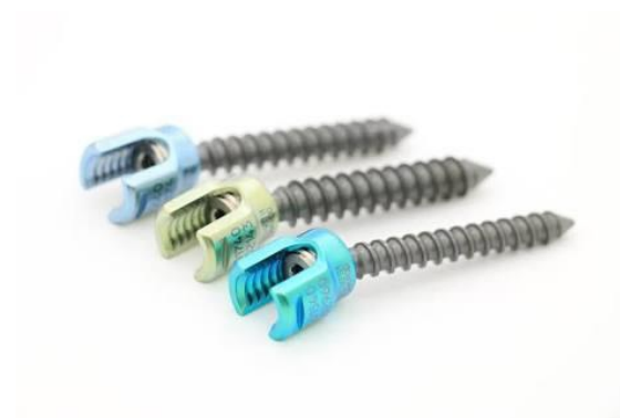
Pedicel Screw titanium