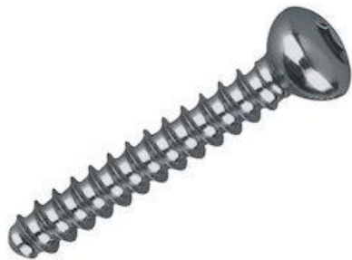
4.5MM Cortical Screw Stainless Steel