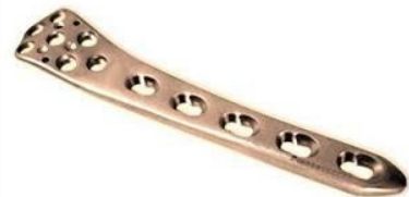
Distal Femur Locking Plate