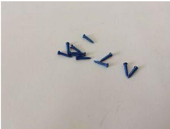
Dental Screws (1.5mm*2mm*2.7mm sizes)