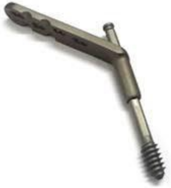
DHS Locking Plate with Leg Screw