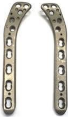
Lateral Tibia Locking Plate