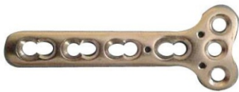
Locking T Plate Titanium