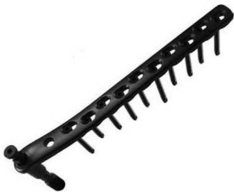
DCS Locking Plate with Leg screw