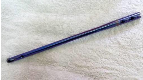
Interlocking nail Titanium