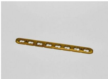
Locking Plate Titanium Narrow