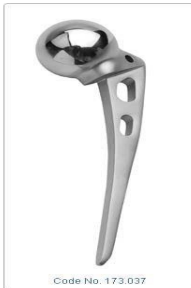
AMP Stainless-steel packed in sterilized box