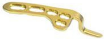
Proximal Humorous Locking Hook Titanium Plate